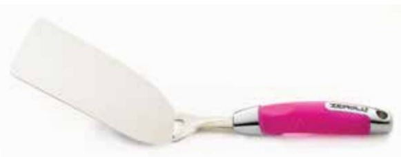
8700** - Stainless Steel Turner

Stainless Steel Turner with a wide head and thin edge for effortless moving and flipping of food. Use with nonstick cookware. Dishwasher safe.