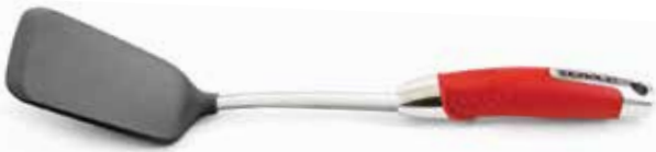
8500** - Nylon Turner

Nylon Turner with a wide head and thin edge for effortless moving and flipping of food. Use with nonstick cookware. Dishwasher safe.