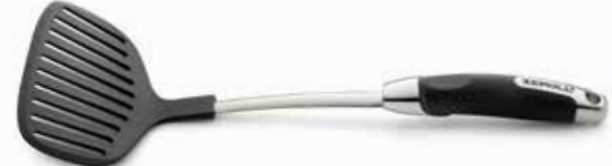
8503** - Nylon Slotted Turner (Large)

Nylon Slotted Turner with slots drains unwanted liquid from food. The thin edge allows for effortless moving and flipping of food. Dishwasher safe.