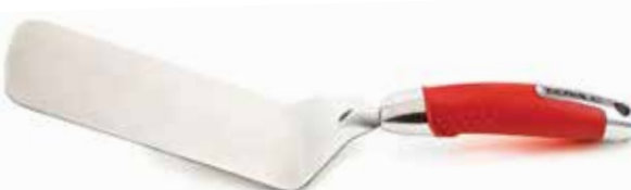
8702** - Stainless Steel Extended Turner

Stainless Steel Slotted Turner with slots drains unwanted liquid from food. The thin edge allows for effortless moving and flipping of food. Dishwasher safe.