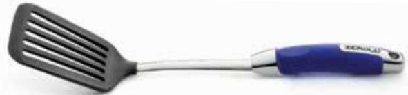
8501** - Nylon Slotted Turner

Nylon Spaghetti Server is a perfect match for hardy pasta pots. Dishwasher safe.