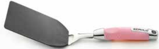
8502** - Nylon Flexi Turner

Nylon Turner with a wide head and thin edge for effortless moving and flipping of food. Use with nonstick cookware. Dishwasher safe.