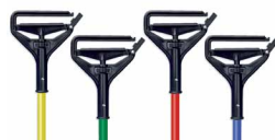
#94 Speed Change™ Mop Handles