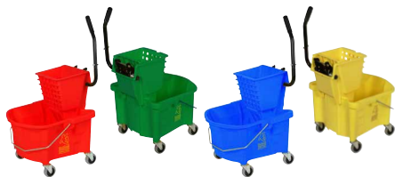
26qt. Splash Guard™ Side-Press Combo (Buckets & Wringers are also available separately)