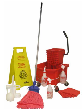
Restroom Value Pack

Items are available in a variety of sizes and colors - see chart on the back or go to www.continentalcommercialproducts.com for more information.