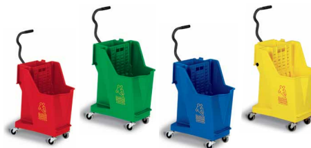
UniBody® Mopping System