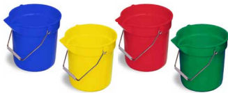
Huskee® 10qt. Bucket