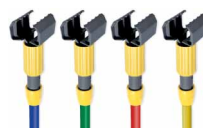
Super Jaws™ Mop Handles