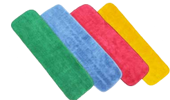
Super Pro II™ Microfiber Mops