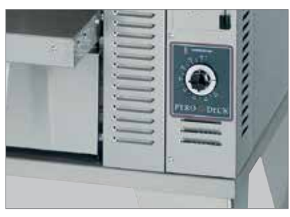
650°F quick recovery throttle thermostat