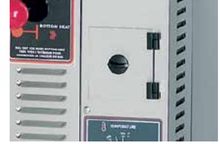
Hinged door for easy access to gas valve