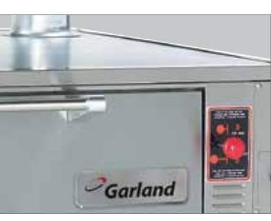
Independent top and bottom heat control