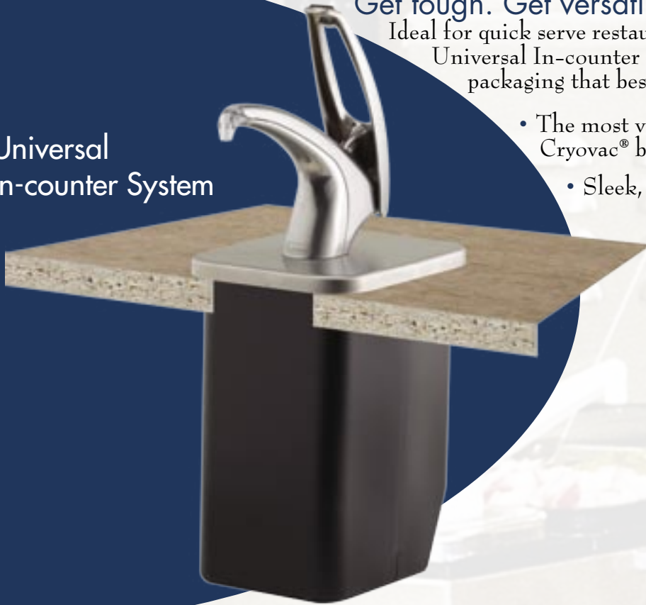
Universal In-counter System

Ideal for quick serve restaurant chains and concession stands, the Universal In-counter System gives customers options for using packaging that best fits their needs.