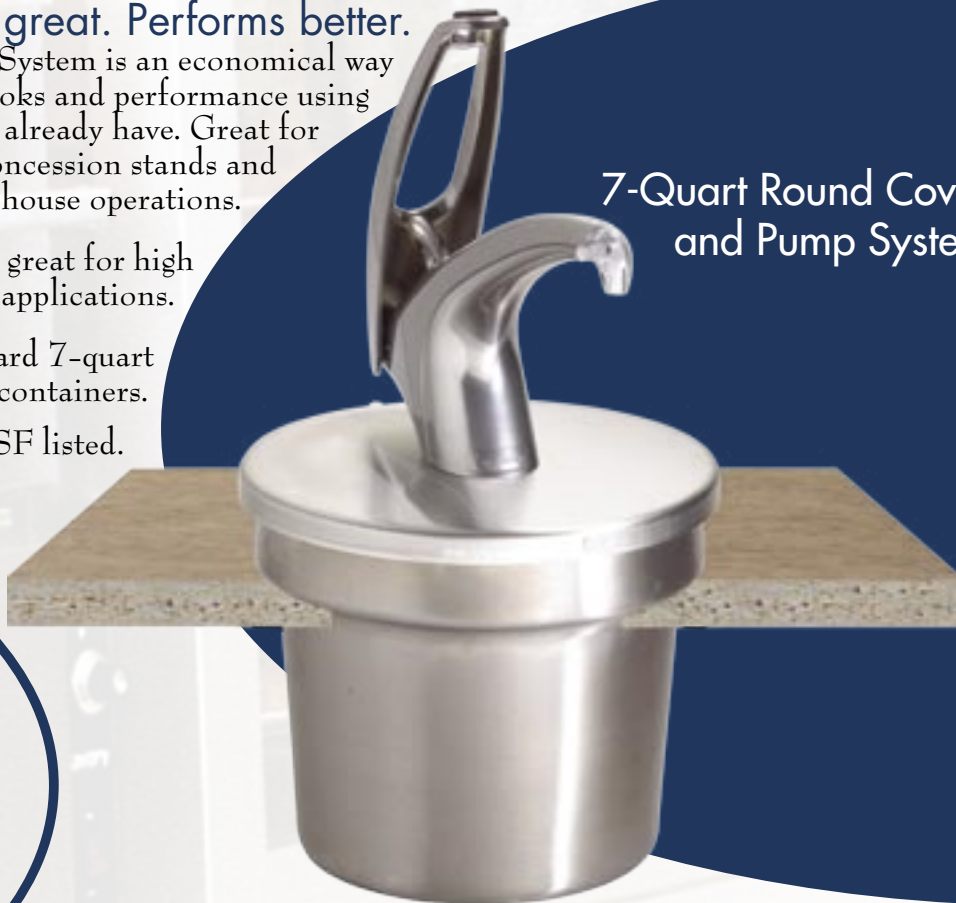
Round Container Not Included.

Our portion cup dispensers rise to the top.