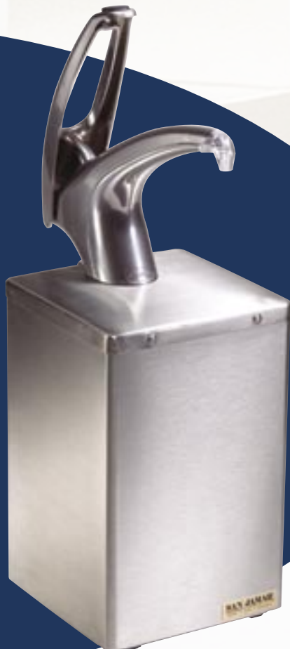
Countertop Box System

All systems come complete with a tamper resistant spring latch.