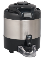
TF SERVER, DSG2 1G SST NOBASE