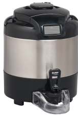
TF SERVER, DSG2 1G SST CD NOBAS