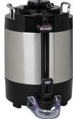
TF SERVER, 1.5G/5.7L MECH NOBASE