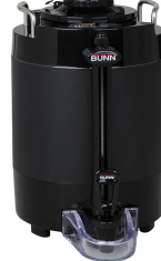
TF SERVER, 1.5G/5.7L MECH BLK NOBASE