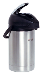
AIRPOT, 3.0L SST LA SINGLE PK