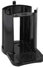
STAND ASSY, TF SERVER