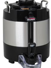
TF SERVER, 1G/3.8L MECH NOBASE