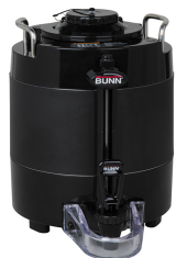
TF SERVER, 1G/3.8L MECH BLK NOBASE