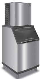
RN-1078C Remote Nugget Ice Machine on B-570 Bin