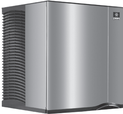
RN-1078C Remote Nugget Ice Machine - 115V