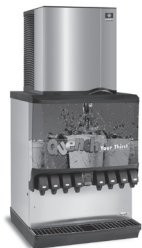
RN-1078C Remote Nugget Ice Machine on Servend SV-250 Dispenser