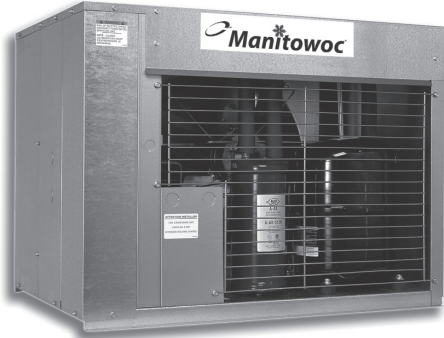
RCU Condensing Unit - 208-230V