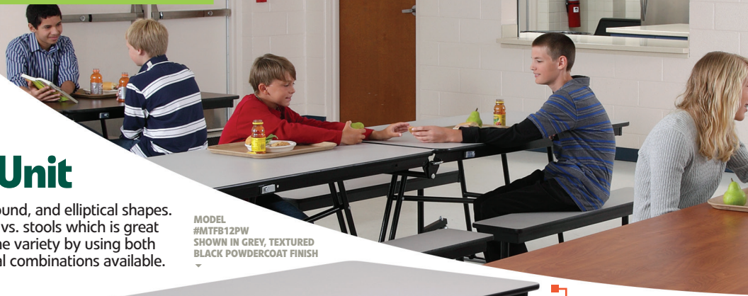
MODEL #MTFB12PW SHOWN IN GREY, TEXTURED BLACK POWDERCOAT FINISH