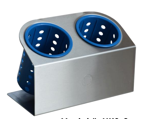
Model #: HKS-2 (Shown with RP-25-BLUE cylinders)