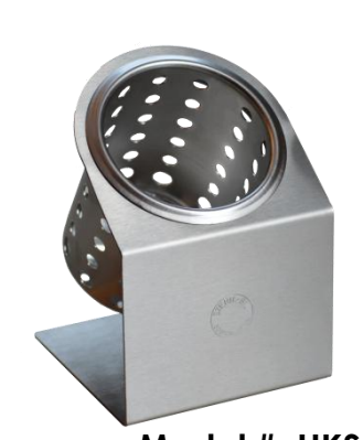
Model #: HKS-1 (Shown with S-500 stainless cylinder)